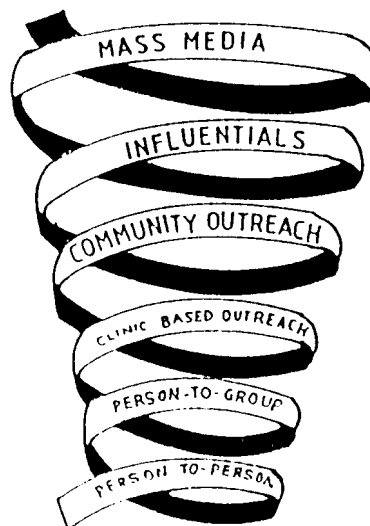
Figure 2 Spiral of IEC activities

The initial IEC on HIV/AIDS gave basic information about the aetiology and mode of transmission of the disease. Subsequent messages have been geared towards achieving behavioural change, and dispelling rumours and misconceptions about the disease. As observed in other parts of the world, serious misconceptions about the origin and transmission of the disease. Witchcraft, act of God, punishment for disobedience, insect bites, continue to be quoted as sources of HIV infection in Ghana (Ametewe 1992; Anarfi and Antwi 1993) similar to those reported by Carballo and Kenya (1994) in other parts of sub-Saharan Africa.